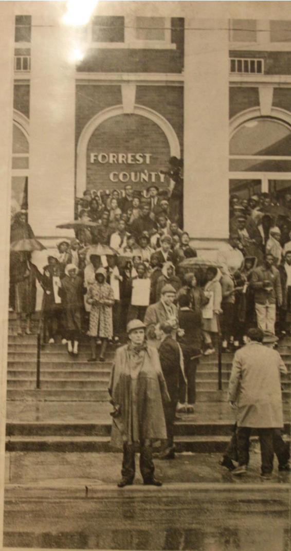
All photographs were taken during Freedom Day at Hattiesburg, Mississippi, on January 22, 1964.

This summer, SNCC, in cooperation with COFO, is launching a massive Peace Corps-type operation in Mississippi. Students, teachers, technicians, nurses, artists and legal advisors will be recruited to come to Mississippi to staff a wide range of programs that include voter registration, freedom schools, community centers and special projects.