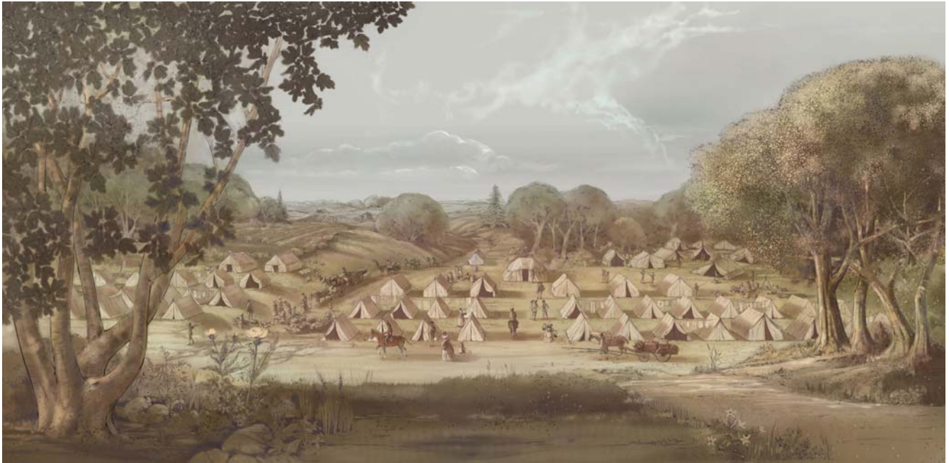
Artist's rendering of Continental army camp on Long Island, July 1776