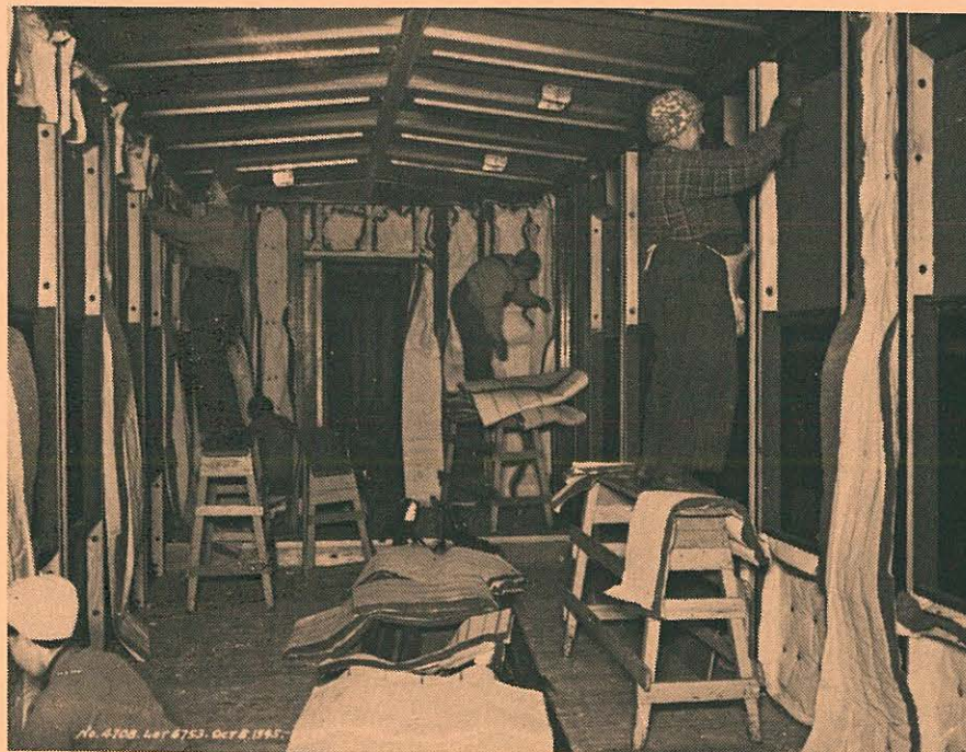
WOMEN WORKERS INSTALL WINDOW SHADES IN TROOP SLEEPER