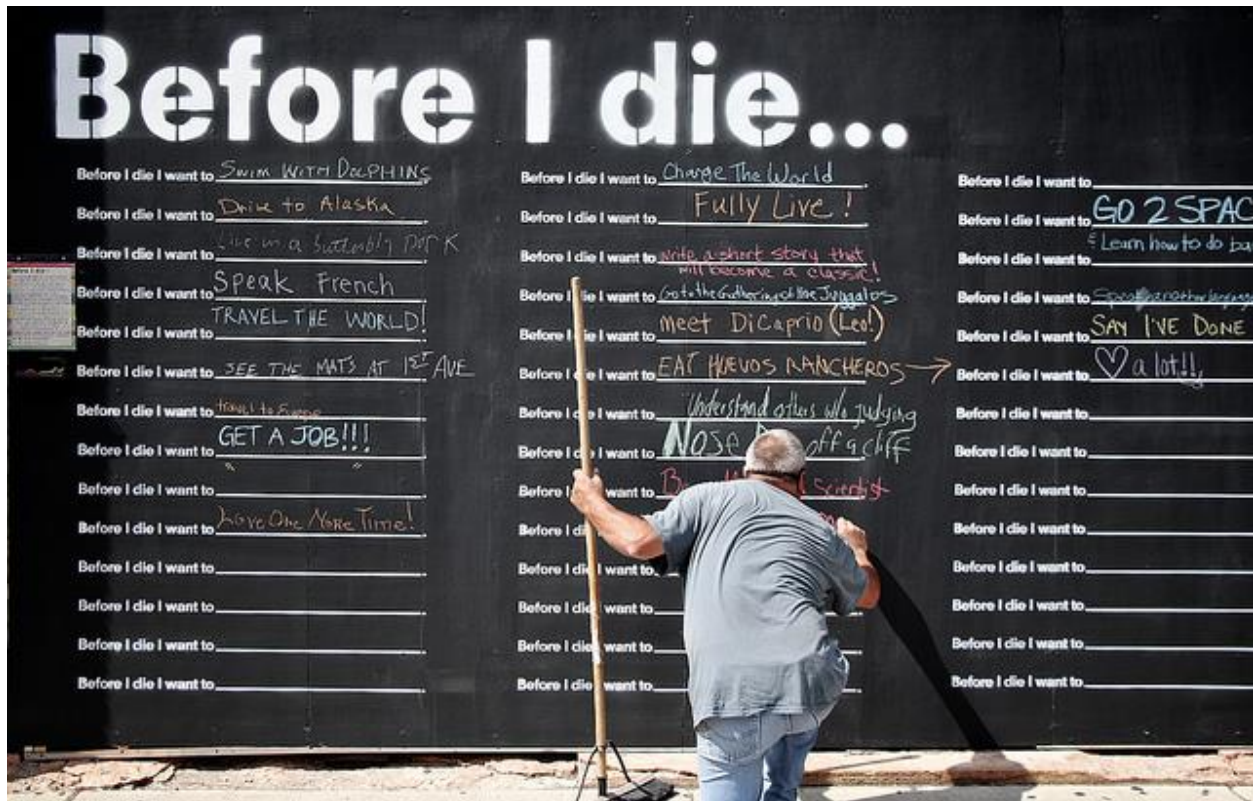
“Before I Die” wall located in the North Loop neighborhood of Minneapolis at 212 3rd Avenue North.