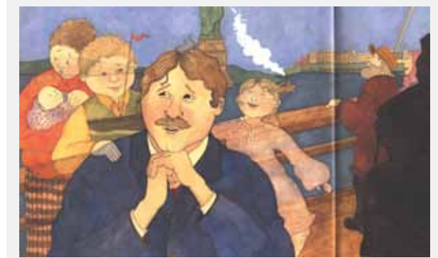
Feivel thinking of his family on his way to America, from Feivel's Flying Horses